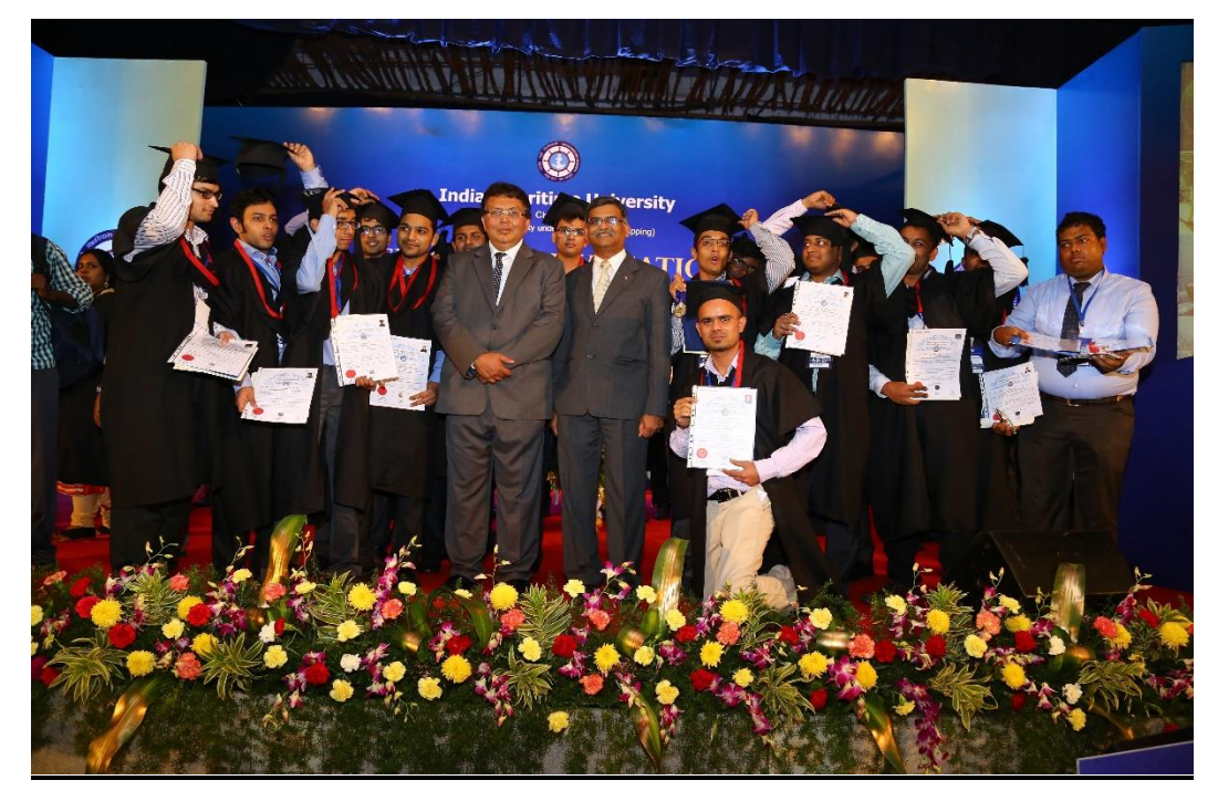
The Vice Chancellor with the students at the 2<sup>nd</sup> Convocation