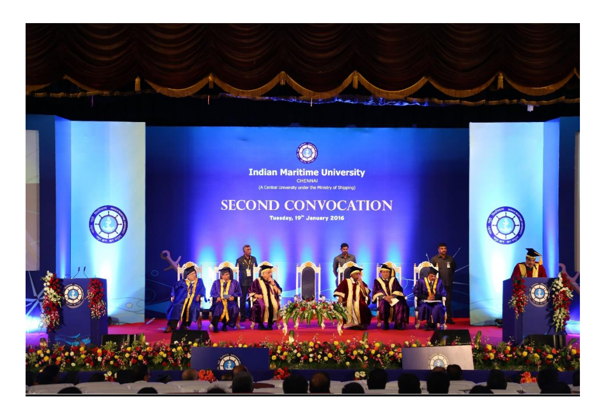
Dignitaries at the 2<sup>nd</sup> Convocation